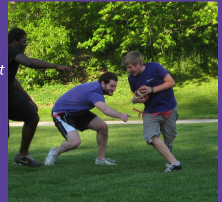
Matches get active playing flag football at a Be Active! event.