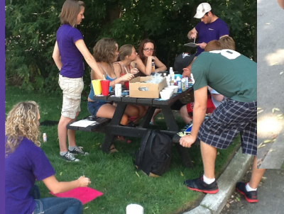
Matches created works of art during our ArtFusion event.