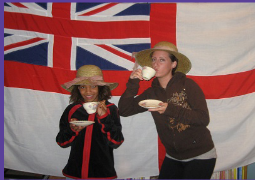
Matches celebrate their Anniversary with Tea for Two.