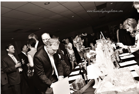
The 34th Big Bash May 2012