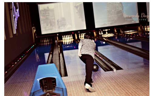
Bowl for Kids Sake February 2013