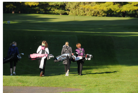
The 24th Annual Barbara Rankin Golf Classic September 2012