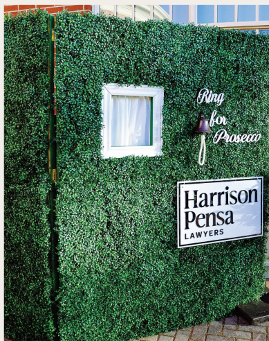
Ring for Prosecco

Total Pageviews Amount Raised Number of Bids 15,965 $30,205 454